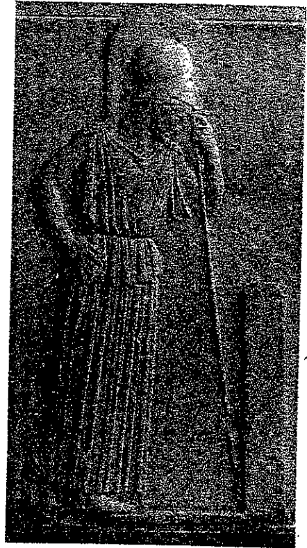
Athena (c. 460 B.C.). Stone.

"Ah, bitterly you need Odysseus, then! High time he came back to engage these upstarts. I wish we saw him standing helmeted there in the doorway, holding shield and spear,