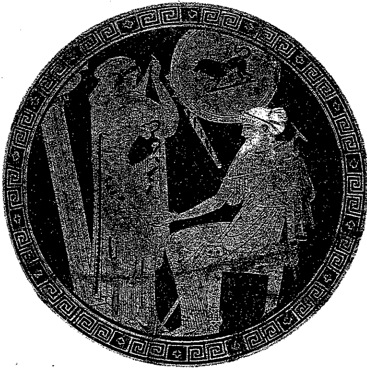
Helen and Priam, King of Troy. Krater interior.